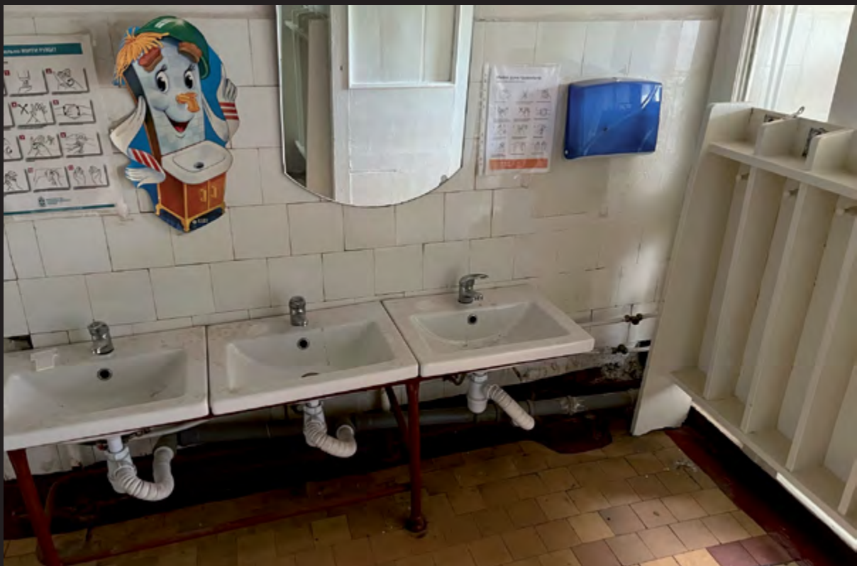
👁️ ↑ A bathroom facility in a temporary shelters for displaced people in Kharkiv, Ukraine. Shelters, which are often in schools or nurseries, often do not have physically accessible sanitation for people with disabilities.